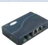
VRE-1 Range Extender