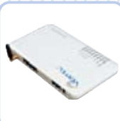
VRE-3G Range Extender